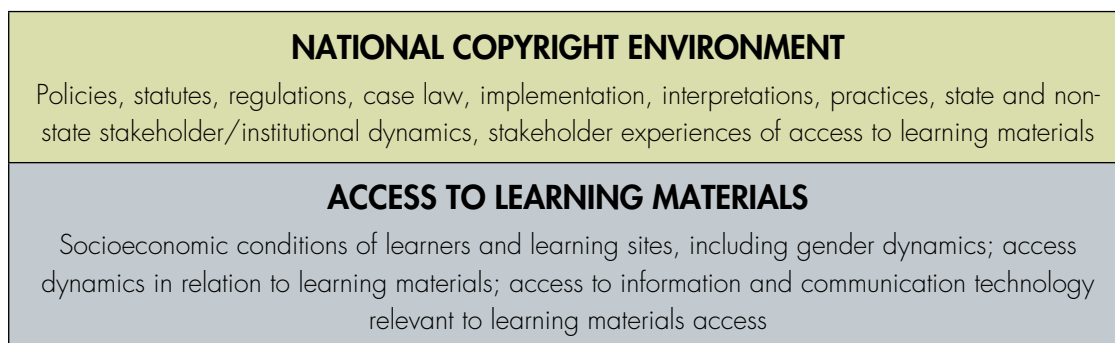
Figure 1: Constituent parts of the Copyright Environment & Access to Learning Materials